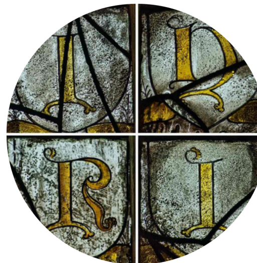
Medieval stained glass spelling out INRI, Latin acronym for Jesus of Nazareth, King of the Jews.