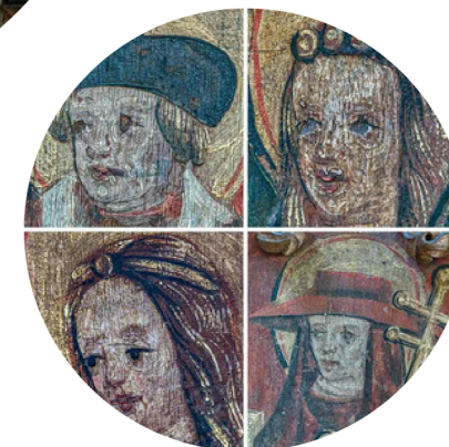
Faces from the rood screen.

The top of the Rood Screen has had some repairs but the bottom, the wainscoting, is all original.